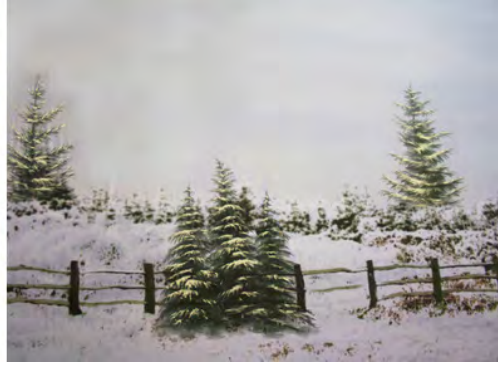
Additional scenic elements were painted onto the SoftDrops once they arrived on set

According to Cullen, applying paint to the printed SoftDrops did not present any major difficulty once they ensured that the quality of the printed and painted whites of the snow matched. It was also important not to apply too much paint; A.) so they didn't blot out the printed elements, and B.) to avoid activating the flame retardants in the SoftDrop. They achieved the desired effect by using Spray N Go rather than relying on too much brush work - but testing is always recommended before painting too much scenery onto a SoftDrop.