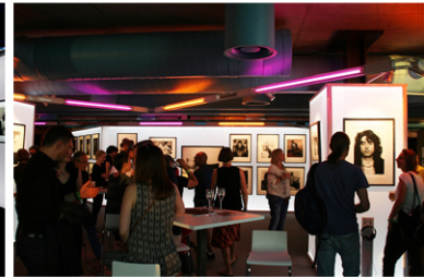
Montreux Jazz Festival

Art Director Andreas Witt's concept for lighting the photographs included a glowing background with each photograph illuminated by its own spotlight. Witt discovered Rosco's VariWhite RoscoLED Tape and not only found that it could be easily mounted and adapted for touring, but its high output made it the perfect choice for the backlit walls.