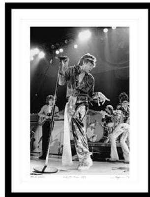
Rolling Stones, Los Angeles, 1973