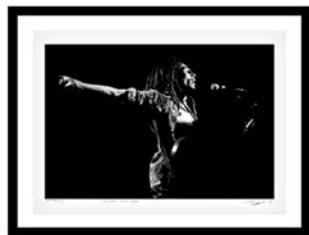
Bob Marley, Santa Monica, 1979