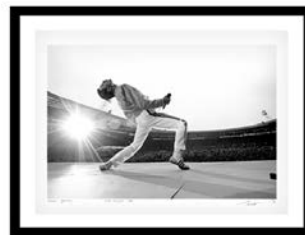
Freddie Mercury, London, 1986