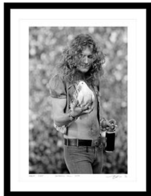
Robert Plant, San Francisco, 1973

Neal Preston is a world renowned music photographer who has portrayed almost every rock legend of the past four decades. He has accompanied many iconic personalities on their tours and captured some of the greatest rock moments – on and off stage – with his camera. Artists including: Janis Joplin, Fleetwood Mac, David Bowie, Bruce Springsteen, Pink Floyd, Queen, The Rolling Stones, Bob Marley and Tina Turner are amongst Neal's impressive collection.