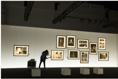
LDI, Las Vegas

As Led Zeppelin's Robert Plant once said of Neal's work: "whenever I see Neal shooting from the pit, I know his eye, I know he'll be in the right place and when I see the photo later it will often feel just like it felt to me onstage - except larger, with an echo of sound and fury." Thanks to the touring exhibition "Neal Preston - In the Eye of the Rock'n'Roll Hurricane," visitors get to view several of Neal's iconic photographs and experience the "echoes of sound and fury" that Plant described. Originally organised by Rosco's dealer Lightpower, the exhibit has attracted a large number of enthusiastic visitors in Las Vegas, Stockholm, at the Montreux Jazz Festival, and at the Musikmesse Frankfurt Fair.