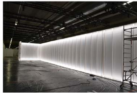
Installation of the VariWhite LED Tape at the top and bottom of each wall

Witt describes his concept: "The idea was to have lighted walls, changing from a warm to a cold white, to create a special ambient in the exhibition area, while the pictures from Neal are still spotlighted via a ETC Mini Gallery Version. After some tests at the Lightpower Studio it was the first choice to use the Rosco VariWhite RoscoLED Tape. Impressed by the quality of binning and output, we did the first big show in Frankfurt at the Musikmesse with about 1000 m 2 and wall heights of 3,80 m!" The results provide a dynamic experience of Preston's photography. As a viewer approaches an image, it may be backlit in warm light that transitions into cool after a short time. It's interesting to note how the visual impact of the photograph shifts as the backlighting fades from cool to warm.