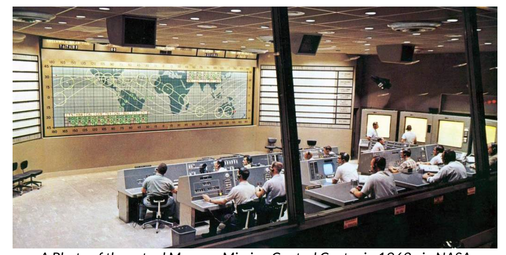
A Photo of the actual Mercury Mission Control Center in 1962