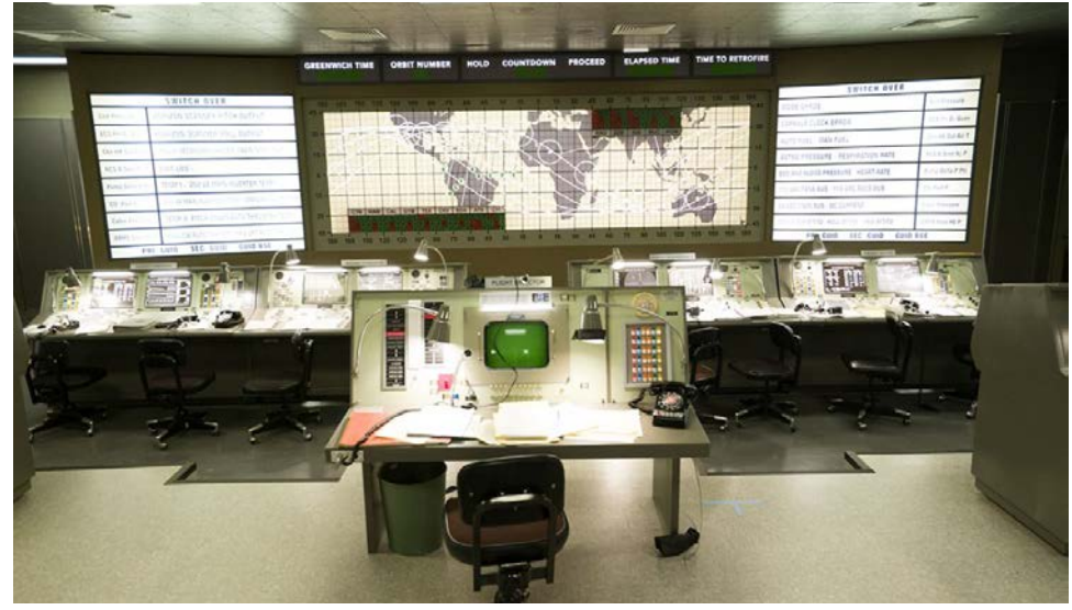
The Mercury Mission Control Center set from "Hidden Figures."