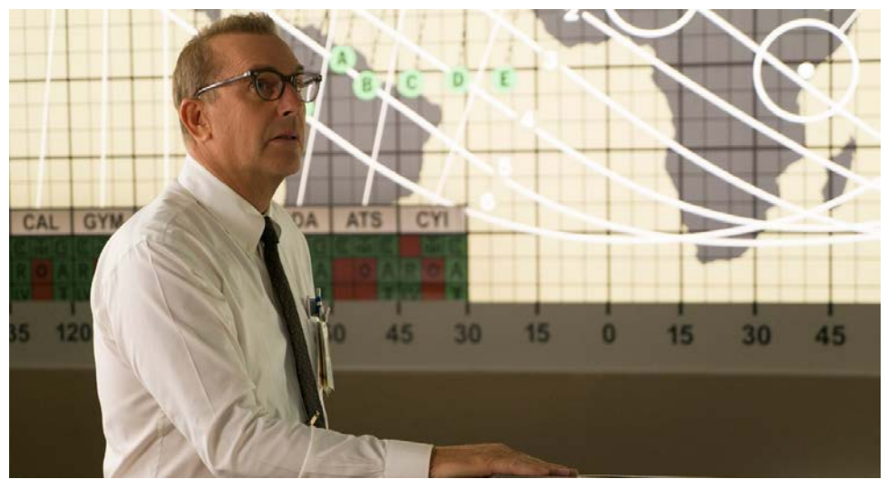
Kevin Costner as Al Harrison in front of the backlit status map in "Hidden Figures."

After all the research had concluded, the production design team sent Rosco a large-scale map graphic that they'd designed based on the research materials they'd received. The 4'H \times 18'L (1.2M H x 5.5M L) map was printed on vinyl and mounted into the MCC set. Because it was a backlit graphic, we printed the image on both sides of the vinyl to keep the backlighting from washing out the image.